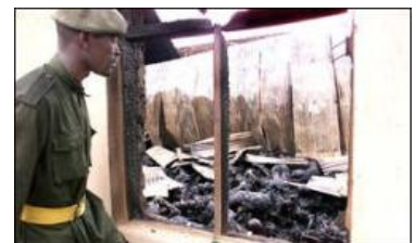
Movement for the Restoration of the 10 Commandments Uganda, 2000 500 dead.