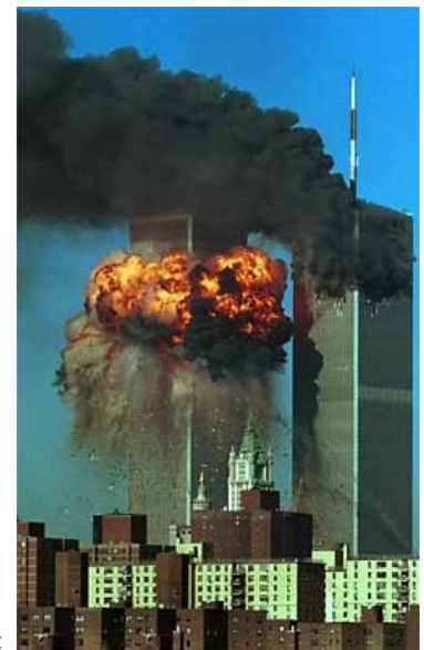
World Trade Center September 11, 2001 Approximately 3,000 dead

Business owners much prefer to hire religious people (unless any originality or creativity is needed in the job, of course) because they are such sheep. This would be less remarkable except that religious writings are filled with references to sheep and flocks — why don't people get it? So, as a result of this, there are forces in society that most definitely support the religious outlook, forces having nothing to do with spirituality (assuming religion has anything to do with spirituality). Businesses want to exploit their labor force, and religion is a perfect training ground for that exploitation.