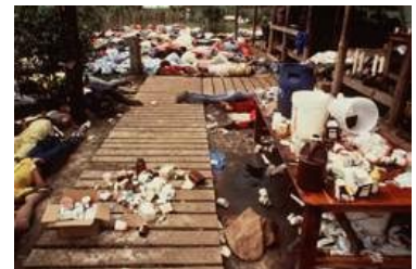
Jim Jones' Church Jonestown, British Guiana, 1978 914 dead.

So religion's promoters are faced with a bunch of potential customers who possess a lot of natural human spirituality — people who might simply stand in the middle of a field, look at the stars, and marvel at their number, the vast distances, and the insignificance of this little planet (just an example — substitute your own favorite spiritual experience). People who might simply feel grateful to be alive, to be able to witness all that beauty. What does religion do to attract those people into a building, get them to join up, put money in a plate? Here is how one might build a religion: