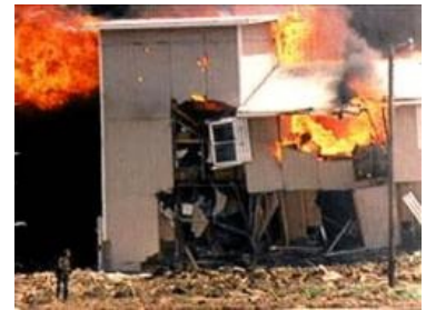
David Koresh's Church Waco, Texas, 1993 79 dead.

This is why religions have been the source of so much suffering in human history — religion isolates people while explaining this is a good thing. Non-believers should not be respected, they should be converted (or killed). As a result, the very best thing that can happen to you in a church is — nothing. The worst? You might be invited to partake of a cyanide-laced sacrament. Even worse, you might do it willingly.