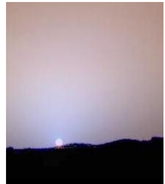
Sunset on Mars Mars Pathfinder Mission, sol 24

The levels of experience are your moral property. No one can take them away from you — except you. Most people wonder what the future will hand them, but people at the alpha level hold the future in their hands.