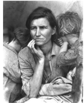
"Migrant mother" California, 1936 Dorothea Lange

This is why feeling alone cannot sustain a human being — it is entirely subjective. This is why feeling can only be the foundation on which a complete structure is built. This is why it is the first of four levels.