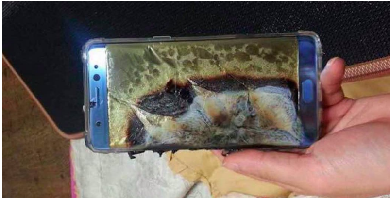
Figure 1: Cell phone with overheated battery

(I lead this section with the battery problem because it represents “low-hanging fruit” – an immediate and practical problem that cries out for a practical solution, as well as being a potentially rewarding field for people able to think creatively.)