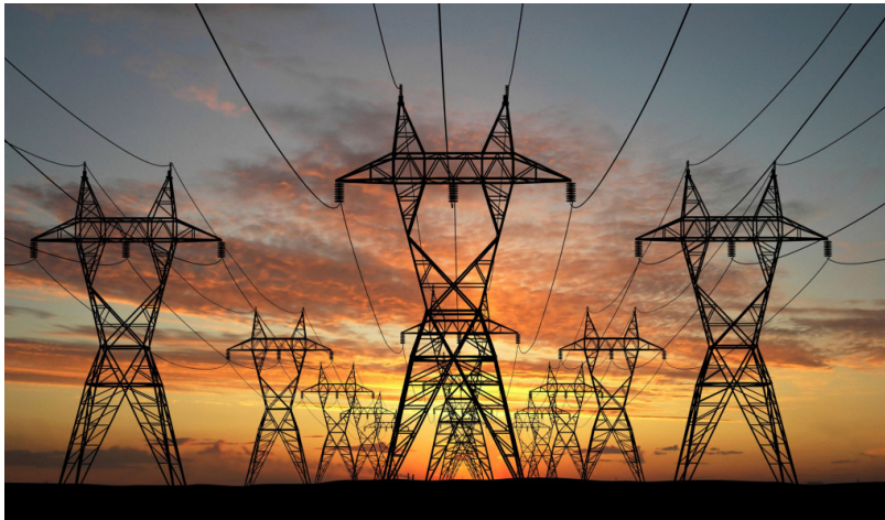
Figure 2: Conventional Power Distribution

Within the lifetimes of today’s students and their children, the present electrical power system will be entirely replaced, end to end – how power is generated, how it is transmitted from place to place, and how it is used: